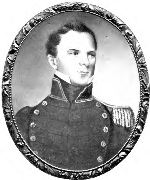
HIRAM PAULDING Lieutenant, U. S. N. About 1828